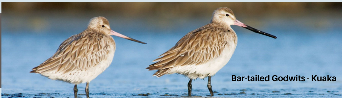
Bar-tailed Godwits - Kuaka

In the days ahead, you will hear Nativity's bell ring at an unexpected time. Church bells historically announced joyful events and tragedies, times of danger and things to celebrate. This Spring, the amazing little Godwits will return from their breeding grounds in Alaska, to feed along the coasts of NZ. When the first cloud of Godwits arrives in Marlborough, over a thousand of the plucky birds will make their home on the Wairau Lagoons for spring and summer. Nativity will celebrate God's amazing creation by ringing our bell. The cathedral in Christchurch pealed their arrival every spring, prior to the destructive earthquakes in 2010. Do explain our bell ringing to your neighbours, and share the good news of God's creation.