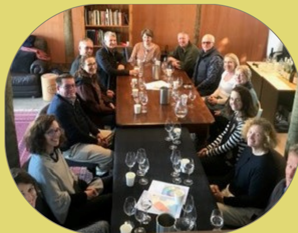
Wine Tasting at the Tyneys'

The Midwinter Dinner held on 19th June at Bamboo Gardens, with a silent auction, was their first fundraiser, towards Nativity's Hall renovations. The auction items were 'food themed' and included delectable food hampers, gift baskets, craft beers, wine, poultry, French-style macarons, a Celebration Cake, invitations to High Teas, Wine Tasting and more!