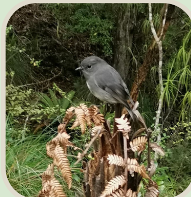
Stewart Island Robin