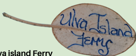
Ticket for the Ulva island Ferry

So I spent most of my time doing virtually nothing, lazing in the Presbyterian Manse with a stunning view and kaka for company. It is the longest period (ever) that this old active restler has spent just reading, sleeping and going for walks. The highlight was a walk around predator-free Ulva Island which is a small sample of what Jesus originally created NZ to be like. So many birds, all living in harmony and flourishing - fantails flitting around Kaka and Mohua, Saddlebacks, Kakariki flocks on the ground and in the tree tops. What a wonderful way to restore one's soul!