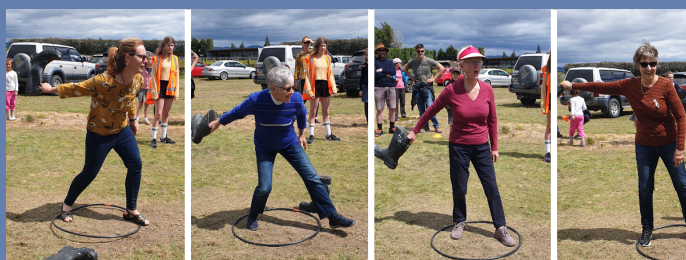
...and the ladies!