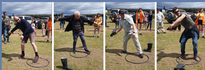
The BIGGEST kids tossing the boot