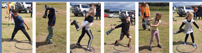
The kids tossing the boot