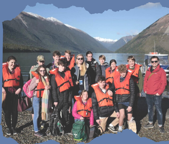
Diocesan Leadership Conference at Lake Rotoiti . Youth Activity