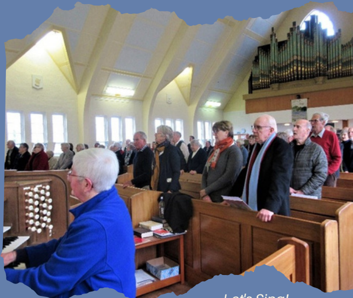
Let's Sing! Enjoying a sing-a-long of the familiar old hymns.