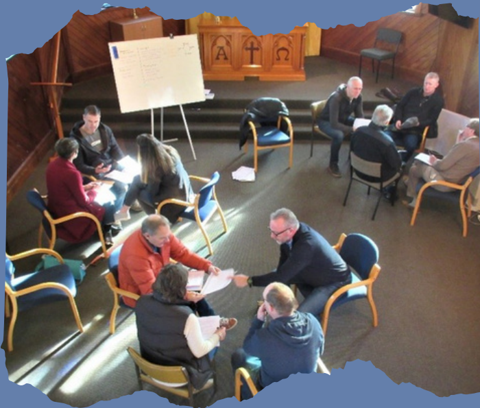
Strategic planning morning for Vestry and Staff Team on Saturday July 3 at Barnies. This will be an ongoing focus for Vestry