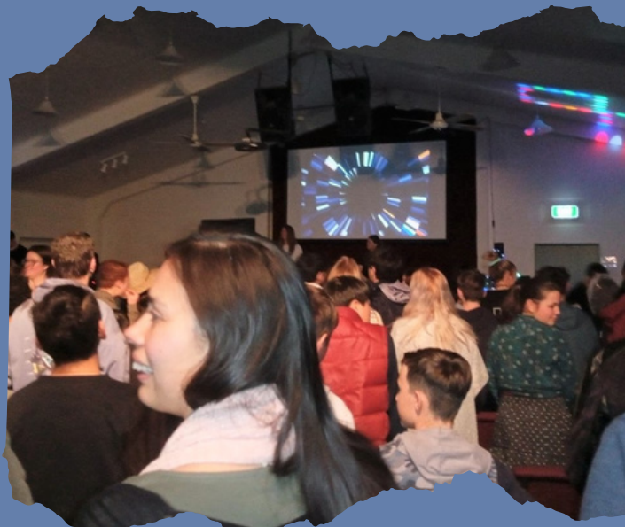
Youth Event at Harvest Life