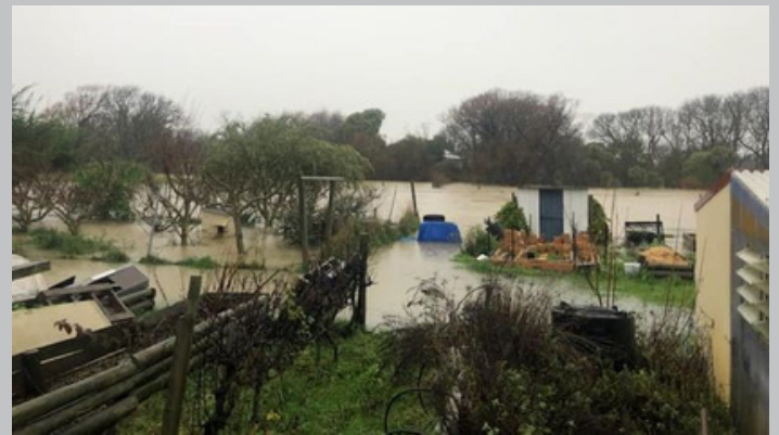
Mundy farm underwater