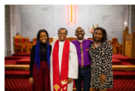
Nelson Anglican Kōrero // June 24th Jun 24, 2021