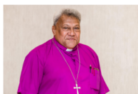
Nelson Anglican Kōrero // July 8th Jul 8, 2021